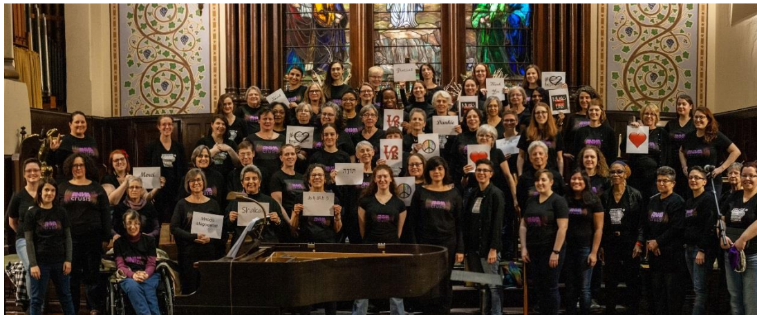
Anna Crusis Women's Choir