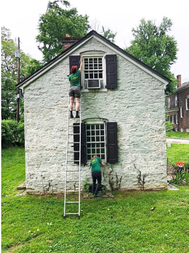
Fairmount Park Conservancy