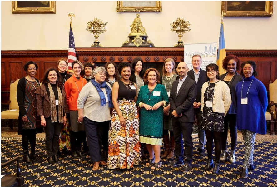
Cultural Fund board, staff, and volunteers at 2019 Art & Culture Grant Ceremony