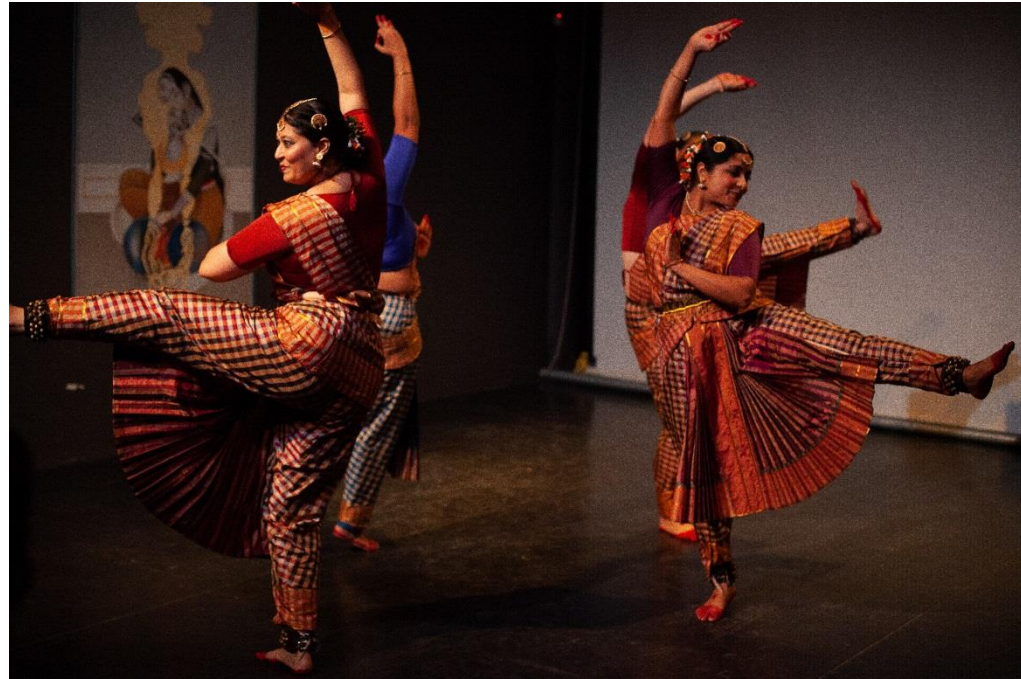
Usiloquy Dance Designs